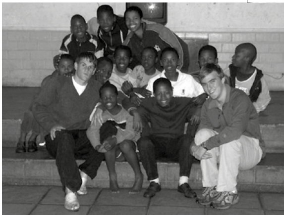
► The boys at Khazimula enjoy the visits from Michaelhouse schoolboys.