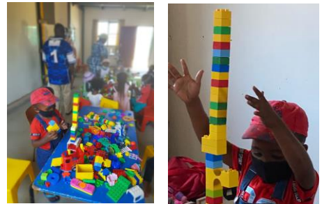
Stimulating play in the preschool