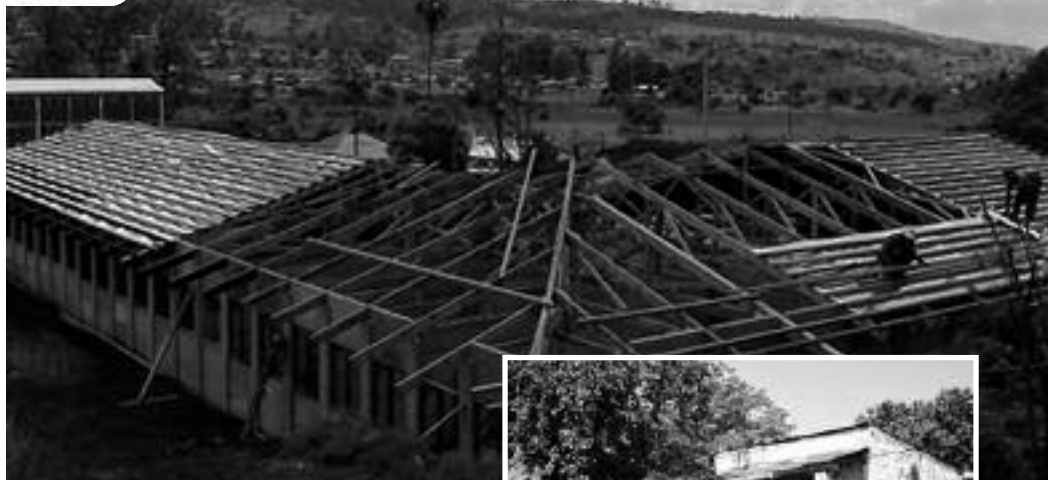
► (Above) The new school in progress and (right) the original mud-walled school.