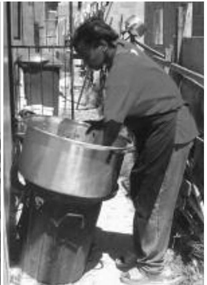
► There's no room inside to wash the big pots, used to prepare nutritious soup and soya-based stews.

back on the streets over the festive season. This year five of their boys were enrolled at high school, bringing the total number at high school to eleven. One of the boys is now doing his third year at Rhodes University and they are looking forward to his graduation.